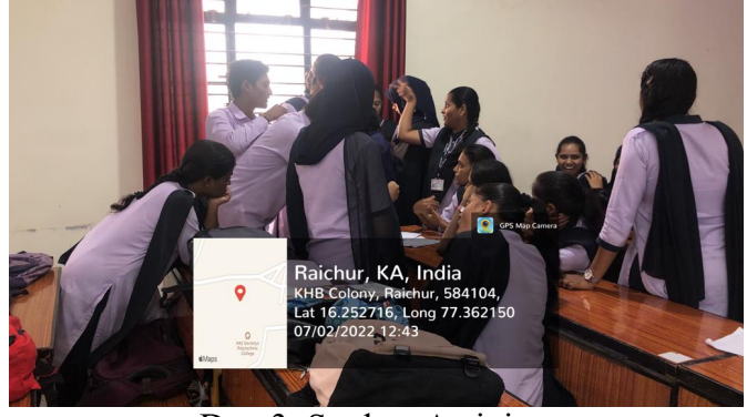
Day-3: Student Activity