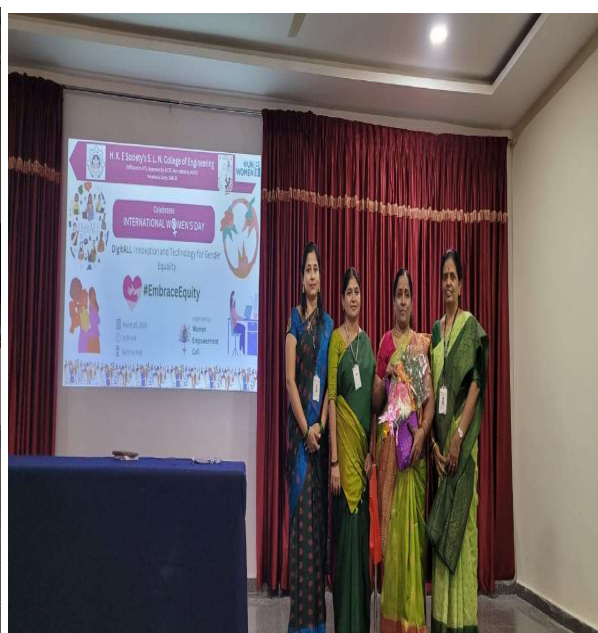
Glimpses of the Day