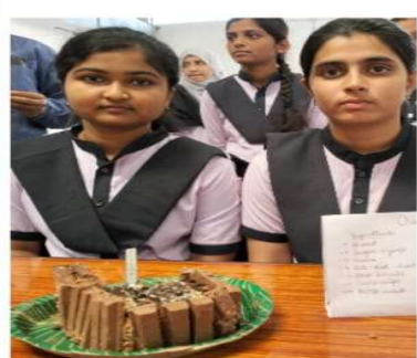
Glimpses of competitions